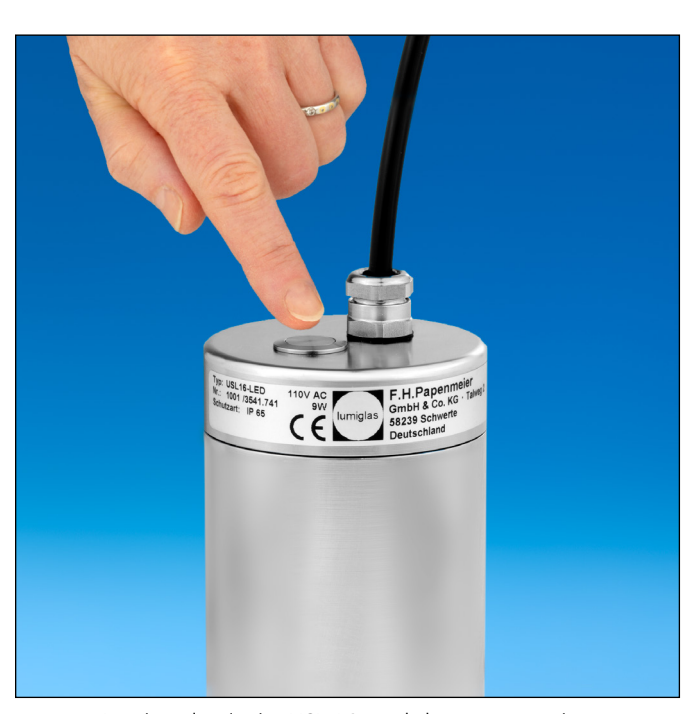
Lumistar luminaire USL 16, push-button operation

a timer to be installed in the power supply line, outside the luminaire! Under no circumstances should the maximum temperatures specified for the luminaire be exceeded.