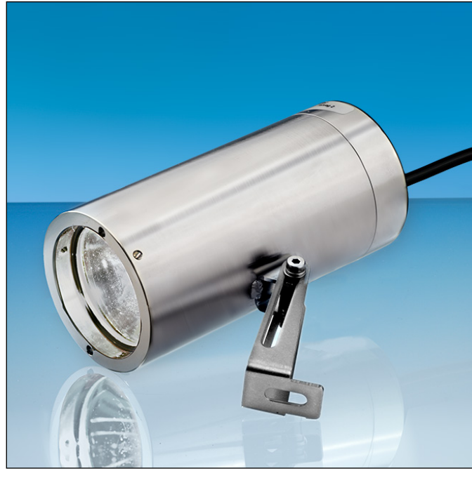
Lumistar luminaire USL 16 with hinged bracket mounting