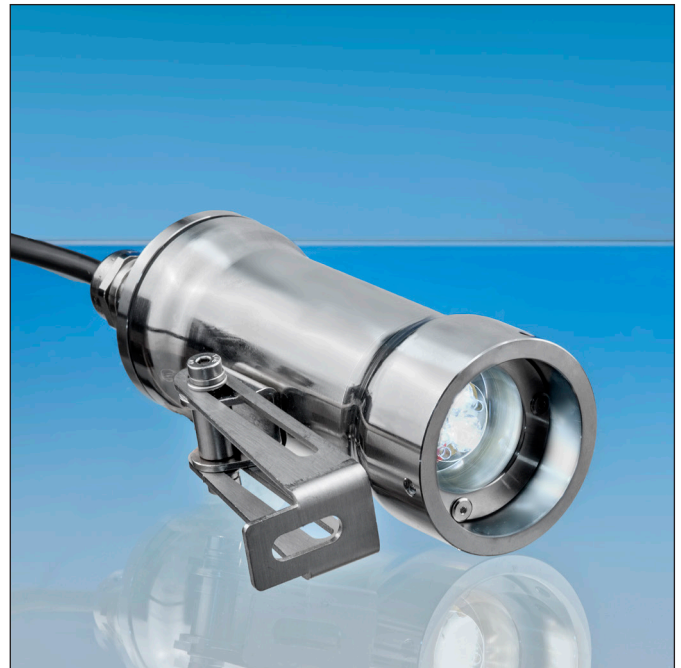
Lumistar luminaire ESL 53-LED-KS with hinged bracket