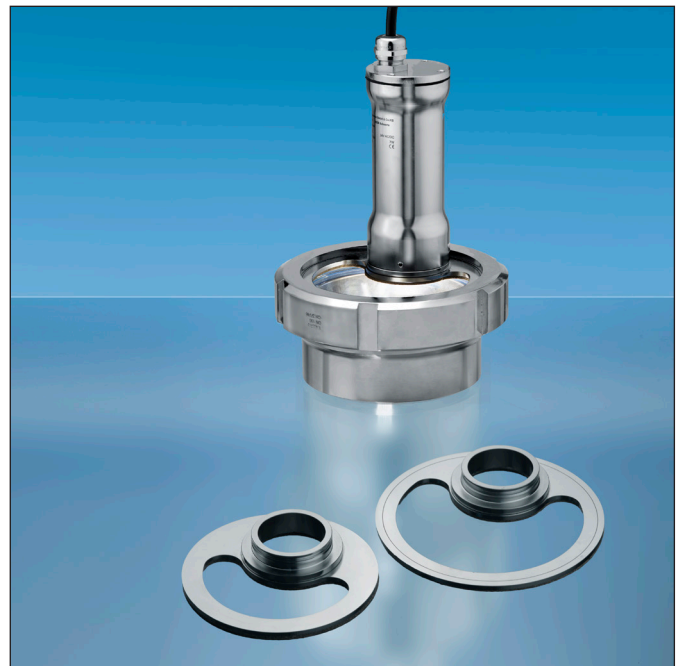
Lumistar luminaire ESL 53-LED-B mounting on a screw-type sight glass fitting according to DIN 11851 or similar