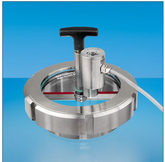
Lumistar luminaire ESL 51-LED-HK installed on a screwed sight glass fitting equipped with Lumiglas wiper unit SW I