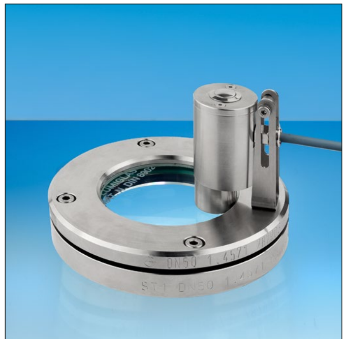
Lumistar luminaire ESL 51-LED-KS adapted to a standard flange