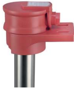
Angular Immersion Heater with HWB Support

ROTKAPPE angular immersion heaters consist of the heated horizontal immersion tube, the long-life heating cartridge, the unheated vertical immersion tube, the terminal casing and the lead.