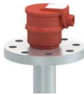
Terminal casing B (steel, zinc-plated); protection IP 64