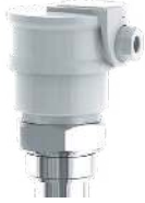
Terminal casing BC 62 (PP) and BC 62/L (PVDF); protection IP 64