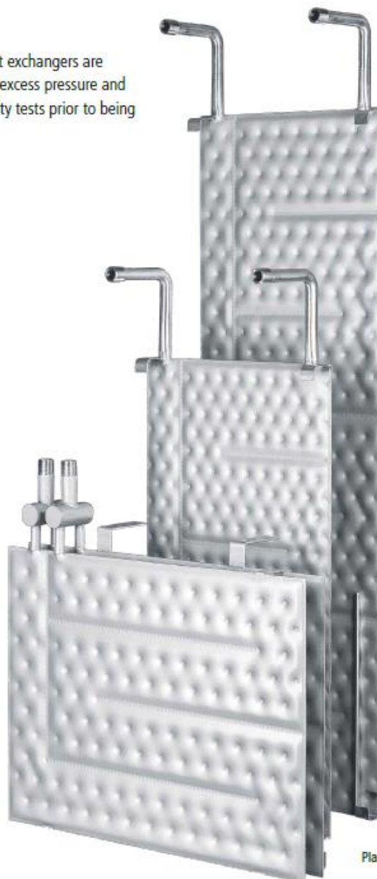
Plate heat exchanger SYNOTHERM®

All plate heat exchangers are subjected to excess pressure and impermeability tests prior to being delivered.