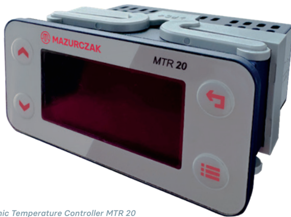
Electronic Temperature Controller MTR 20

The temperature controller MTR 20 is designed specially for the rough operating conditions in surface treatment plants; their front panel is covered with a sheet which is insensitive to chemicals.