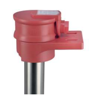
Angular Immersion Heater with HWB Support

ROTKAPPE angular immersion heaters consist of the heated horizontal immersion tube, the long-life heating cartridge, the unheated vertical immersion tube, the terminal casing and the lead.