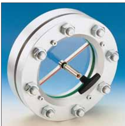
Lumiglas Wiper SW I, fitted into sightglass assembly DIN 28120