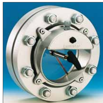
Lumiglas Wiper SW I, as shown adjoining but with Lumistar luminaire fitted.