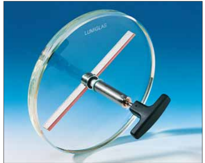
Sightglass Wiper type SW I built into sightglass disc

If the wiper is ordered separately, i.e. not installed into sightglass disc by the manufacturer, the assembly has to be done with regard to separate installation and operating instructions, attached to the delivery.