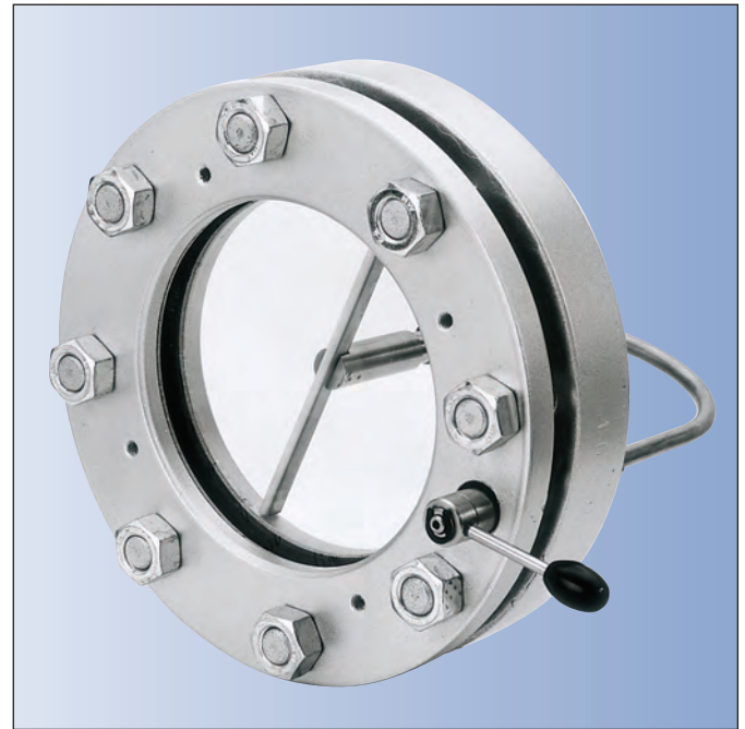
Lumiglas SW II BW mounted into sight glass fitting DIN 28120

Wiper blade: PTFE or silicone rubber All product contact parts are of stainless steel. Mechanical drive internal seal: PTFE