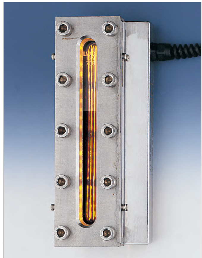
Front view of rectangular sight glass unit, length 250 mm, with side-mounted Lumiglas luminaire REL 01 in stainless steel