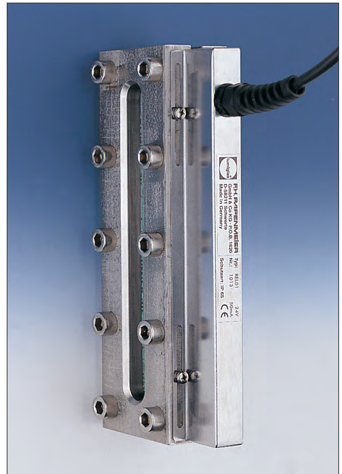
Lumiglas stainless steel luminaire REL 01, attached to the cover flange of a rectangular sight glass unit, side view