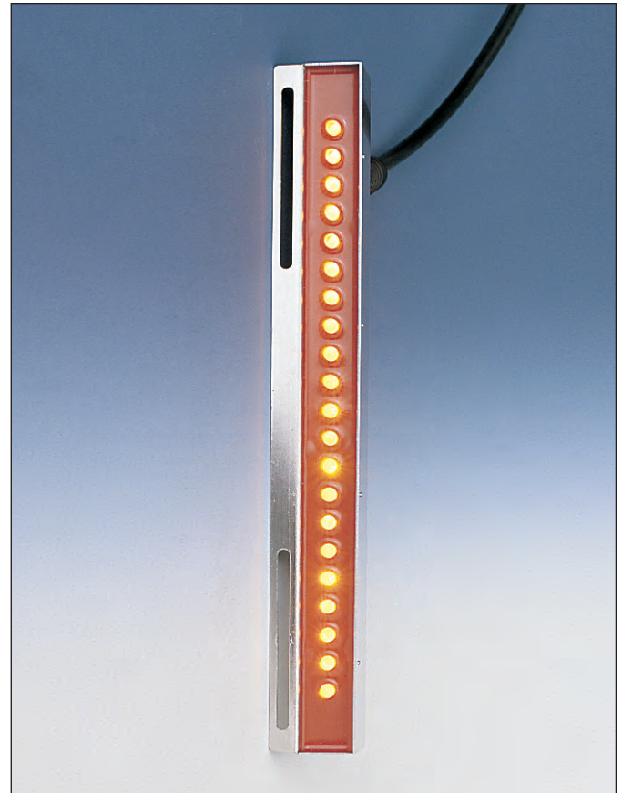
Lumiglas stainless steel luminaire REL 01, luminary side

Additional Lumiglas stainless steel luminaires REL 01 can be installed if the fittings are longer.