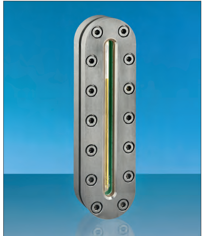
Complete assembly of an oblong oval sight glass fitting

When securing the cover flange, the bolts should be tightened with a uniform torque, starting with the bolts in the middle and working crosswise towards the ends, i.e. in an alternating sequence.